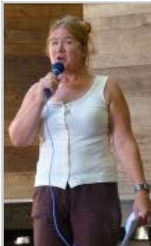
Left & Below: Riverlinks Together Picnic on the Farm at Baxter's, Pipers River